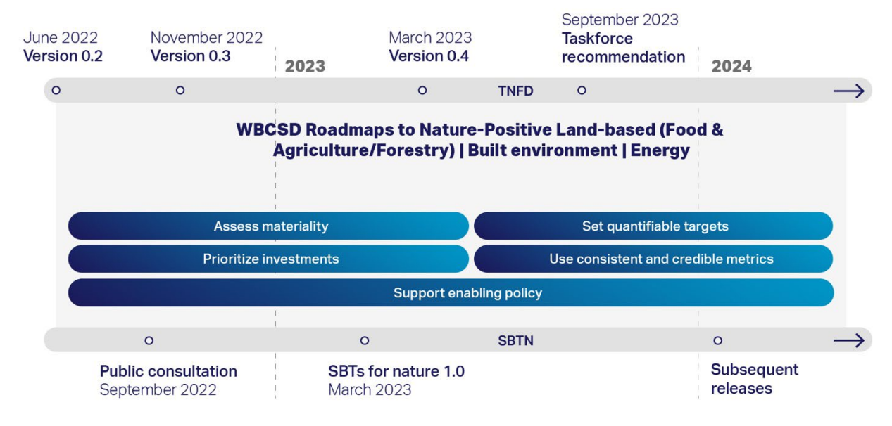
Figure 3: WBCSD roadmaps to nature positive timeline mapped against SBTN and TNFD timelines

These shared objectives and outputs come together to support an agenda to increase ambition, sharpen accountability and accelerate action.