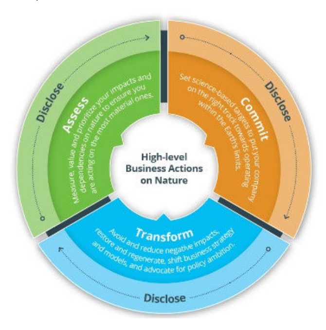
Figure 1: High-level business actions on nature

Leveraging WBCSD's <u>building blocks</u> and other key frameworks, Business for Nature and its partners, including WBCSD, SBTN, TNFD, the World Economic Forum and Capitals Coalition, aligned on the logic underpinning all business initiatives known as the <u>high-level business actions on nature</u>: Assess, Commit, Transform and Disclose (ACT-D).